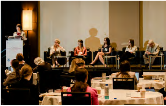
"Foodscape Innovation Successes and Lessons Learned" panel.

Meet consumer demand for fun, accessible and scientifically credible initiatives and products. Understand that consumers are diverse. Whether for product development and marketing or an educational campaign, get to know the target market's view on food, and whether health and sustainability will resonate. Respect the consumer's culture, social and economic realities, and their desire for food and eating to be enjoyable.