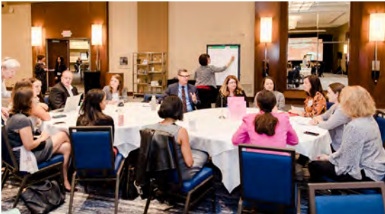
"Innovating to Inspire Healthy Eating Practices Through a Social/Cultural Lens" breakout group discussion.